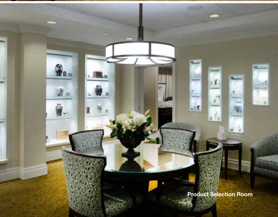
Product Selection Room