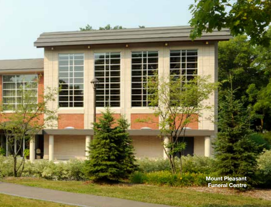
Mount Pleasant Funeral Centre