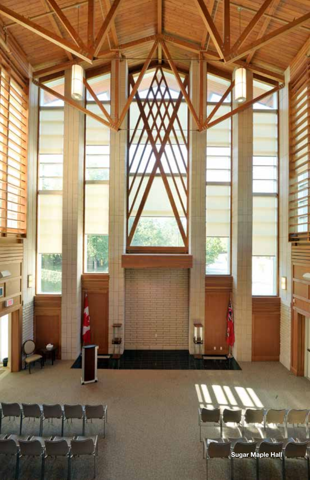
Sugar Maple Hall