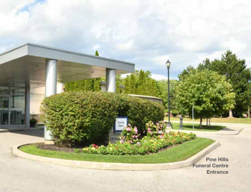
Pine Hills Funeral Centre Entrance