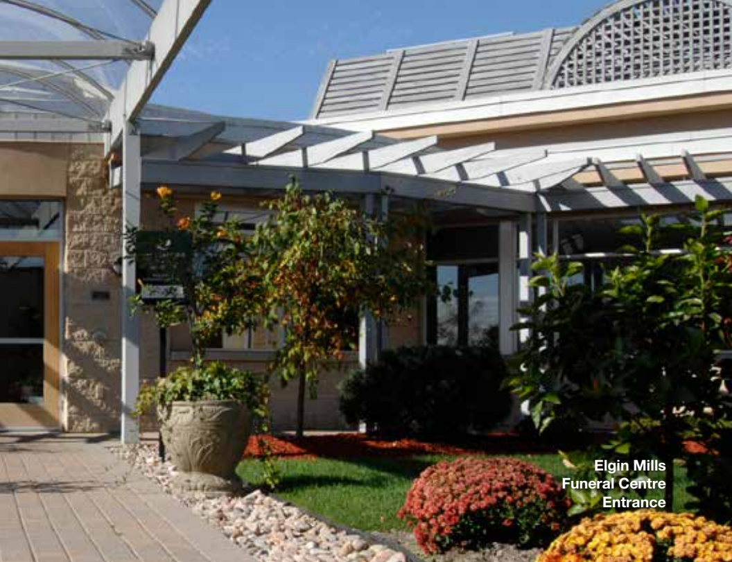
Elgin Mills Funeral Centre Entrance