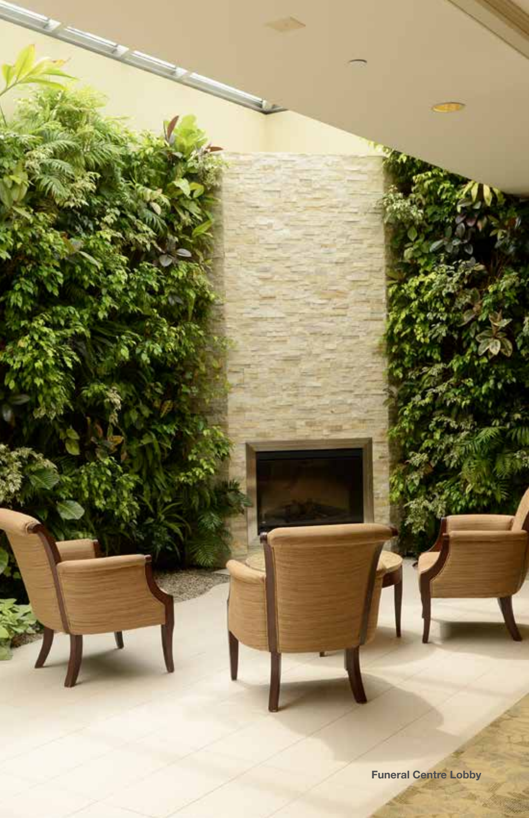
Funeral Centre Lobby