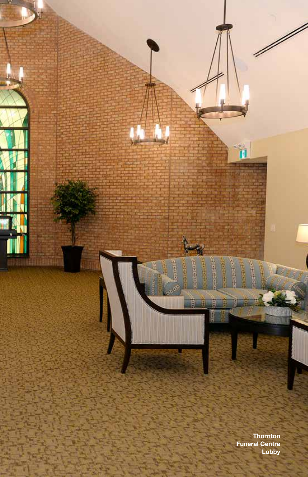
Thornton Funeral Centre Lobby