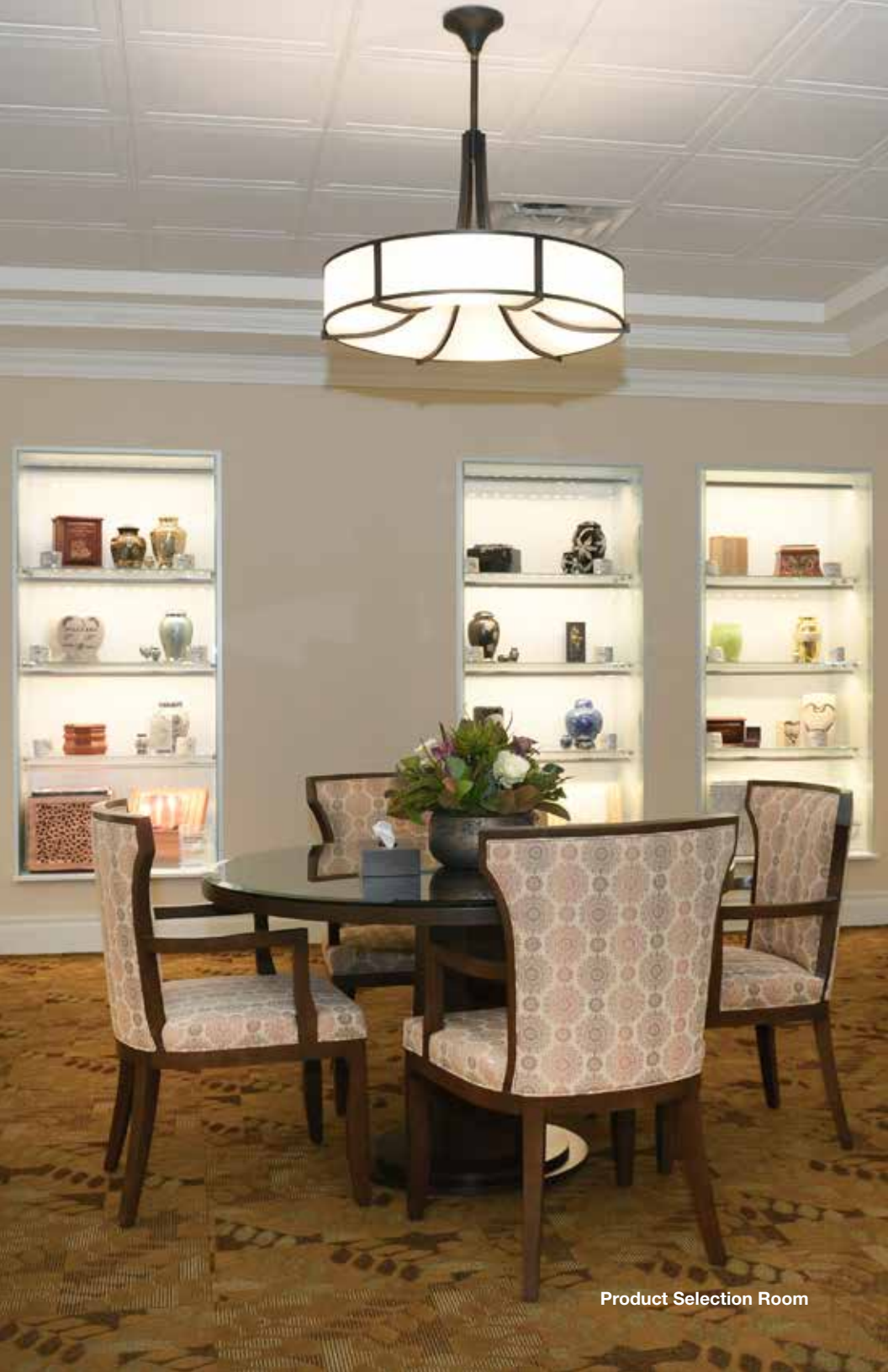
Product Selection Room